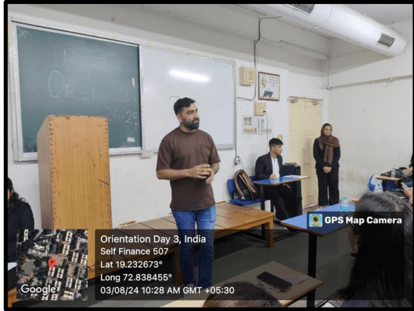
“Seniors guiding us”