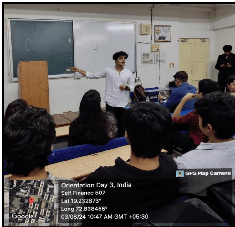
“Alumni sharing their experiences”