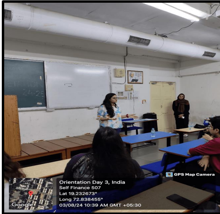
“Being Alumni back to their Alma Mater”